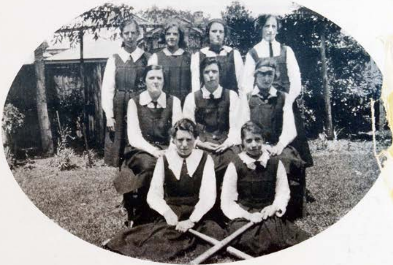
FIRST BASEBALL TEAM.