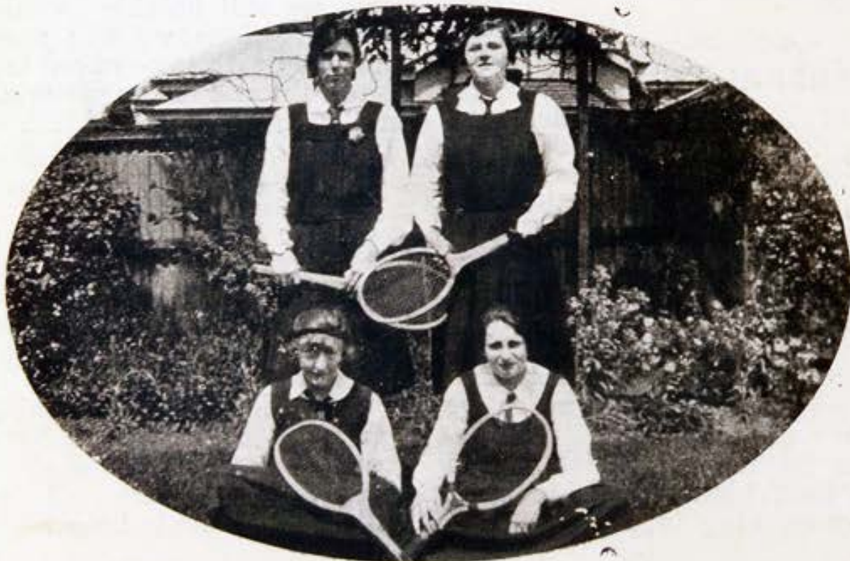
FIRST TENNIS FOUR.