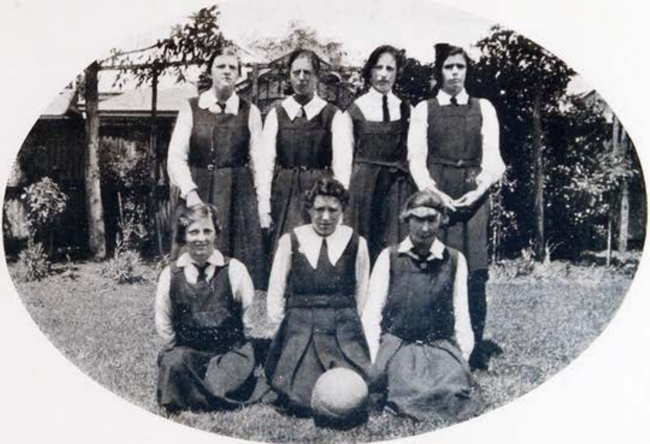
FIRST BASKET BALL TEAM